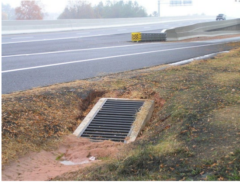
EXHIBIT 5 – SPECIAL PROVISIONS AND CONTRACT REQUIREMENTS

Use Pipe End Structure (719-615-00) when specified in the plans or special provisions. Use pipe end structure in locations where pipe exposed end faces the direction of traffic. Pipe end structures may be used in other locations if approved by the RCE.