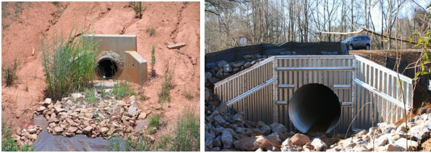
Use Pipe Wingwall

Section when specified in the plans or special provisions.