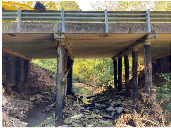
Photo 2. Northeast Side View of Bridge.