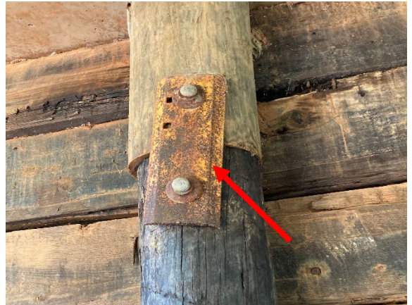
Photo 4. LBP on Yellow Metal Brace.