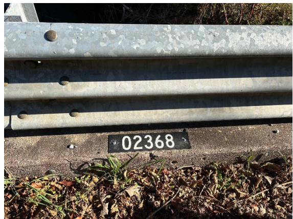
Photo 6 SCDOT Bridge Asset # Placard Attached to Concrete Curb of Bridge.