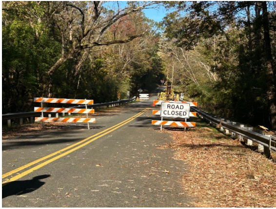
Photo 1. Top View of Bridge.