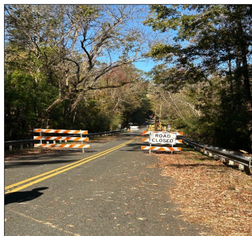
Photo 1 – S-24-166 RBO Tributary to Henleys Creek, Greenwood County.

The existing bridge structure ( \approx 45.2' \text{ L} \times 23.84' \text{ W} , inside curb to inside curb), is located on route S-24-166 (Tillman Territory Rd.) and crosses over a tributary to Henleys Creek in Greenwood County, South Carolina. The construction date of the Bridge is unknown. The structure is a two (2) lane, three (3) span Bridge constructed with pre-fabricated concrete bridge deck and concrete curbing with an asphalt overlay. Each poured-in-place (PIP) bent cap is supported by five (5) structural timber piles. Galvanized metal guardrails are attached to the concrete curbing on each side of the Bridge. Each end bent has a timber soil retaining wall