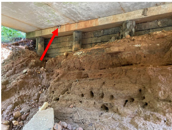
Photo 5. LBP on Silver L-Bracket.