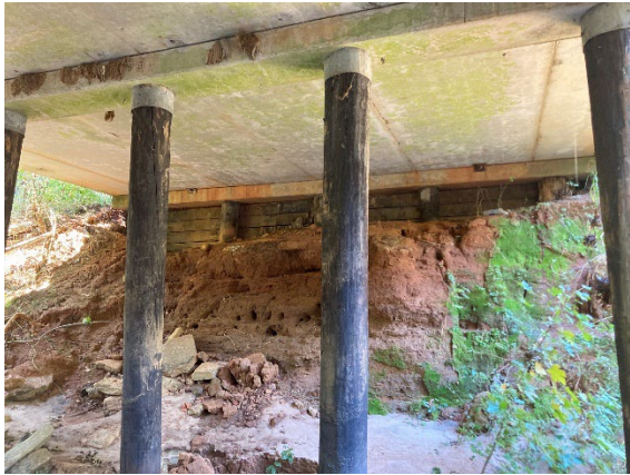
Photo 3. Underside View of Bridge.