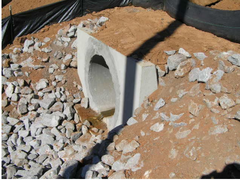
Use Pipe Straight Headwall (719-605-00) when specified in the plans or special provisions. Use straight headwall only in locations where pipe exposed end does not face the direction of traffic.