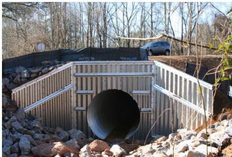
Use Pipe Wingwall Section when specified in the plans or special provisions.