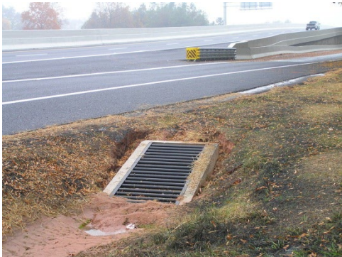
Use Pipe End Structure (719-615-00) when specified in the plans or special provisions. Use pipe end structure in locations where pipe exposed end faces the direction of traffic. Pipe end structures may be used in other locations if approved by the RCE.