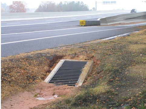
Use Pipe End Structure (719-615-00) when specified in the plans or special provisions. Use pipe end structure in locations where pipe exposed end faces the direction of traffic. Pipe end structures may be used in other locations if approved by the RCE.