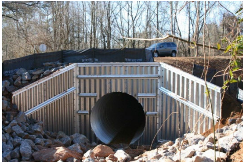
Use Pipe Wingwall Section when specified in the plans or special provisions.