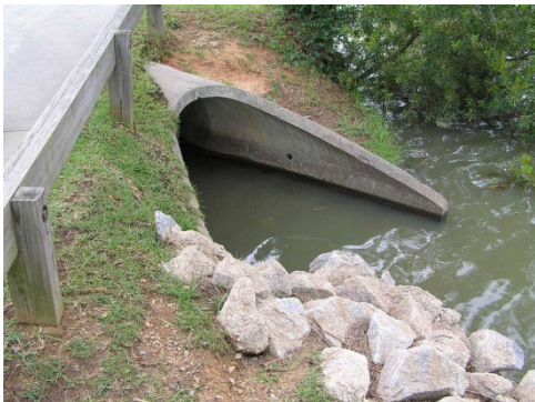
Use Pipe Flared End Section when specified in the plans or special provisions.