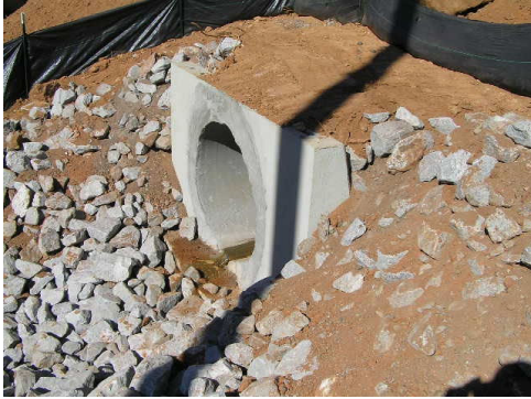
Use Pipe Straight Headwall (719-605-00) when specified in the plans or special provisions. Use straight headwall only in locations where pipe exposed end does not face the direction of traffic.