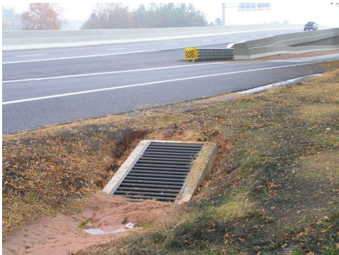
Use Pipe End Structure (719-615-00) when specified in the plans or special provisions. Use pipe end structure in locations where pipe exposed end faces the direction of traffic. Pipe end structures may be used in other locations if approved by the RCE.