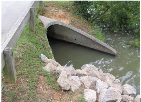
EXHIBIT 5 – SPECIAL PROVISIONS AND CONTRACT REQUIREMENTS