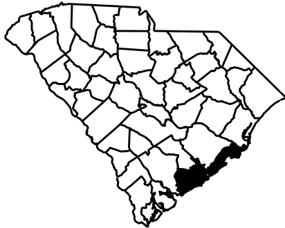
MAP SHOWING LOCATION OF CHARLESTON COUNTY IN SOUTH CAROLINA

GEL | GEOPHYSICS, LLC a Member of THE GEL GROUP, INC.