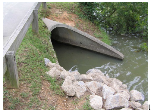
plans or special provisions.

Use Pipe End Structure (719-615-00) when specified in the plans or special provisions. Use pipe end structure in locations where pipe exposed end faces the direction of traffic. Pipe end structures may be used in other locations if approved by the RCE.