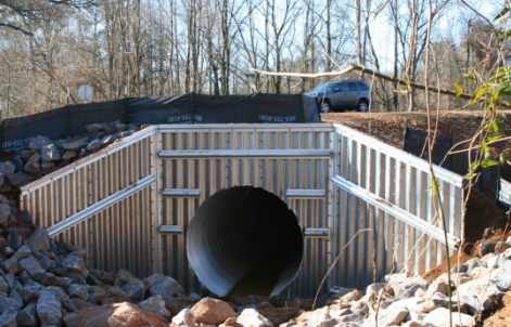
Use Pipe Wingwall