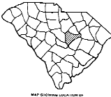
MAP SHOWING LOCATION OF SUMTER COUNTY IN SOUTH CAROLINA

COUNTY POPULATION 1960 CENSUS 102,437 COUNTY AREA IN SQUARE MILES 666