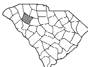
MAP SHOWING LOCATION OF LAURENS COUNTY IN SOUTH CAROLINA

FOUNTAIN INN State 500 Geocentric Co. 1455 Elevation 571-782