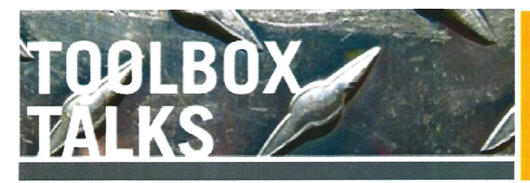
Toolbox Talks are intended to facilitate health and safety discussions on the job site. For additional Toolbox Talks, please visit SAFETY.CAT.COM™