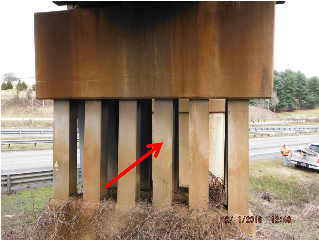
Lead-based paint on silver painted H-piles