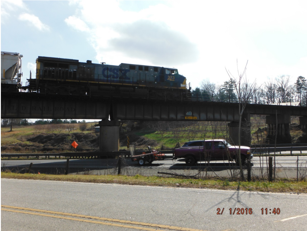
Side view and top view of railroad bridge