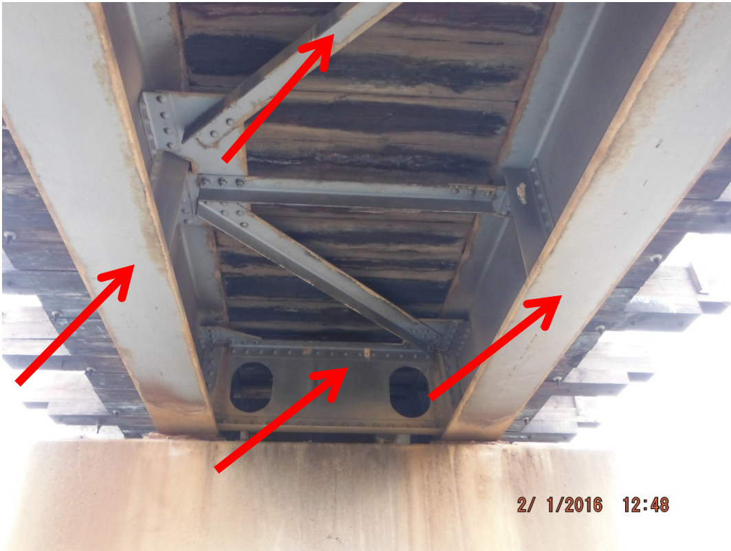
Lead-based paint on silver painted bridge beams, diaphragms, and cross-bracing