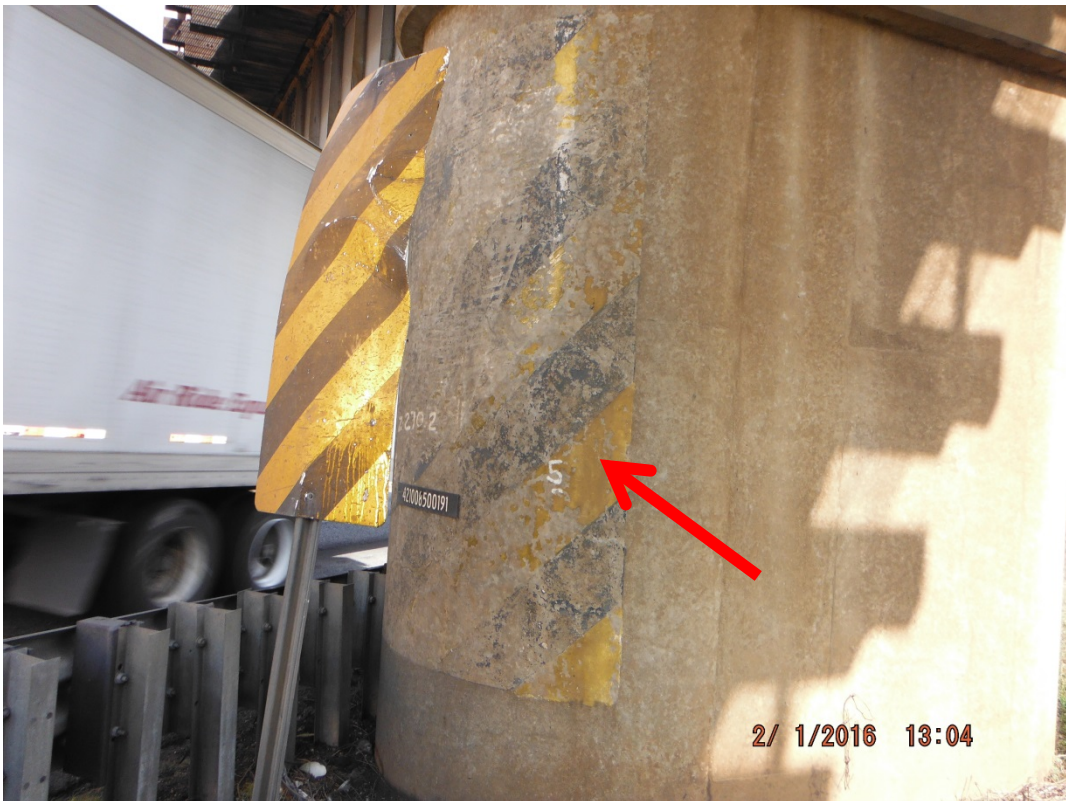
Lead-based paint on yellow caution striping on concrete shaft pier